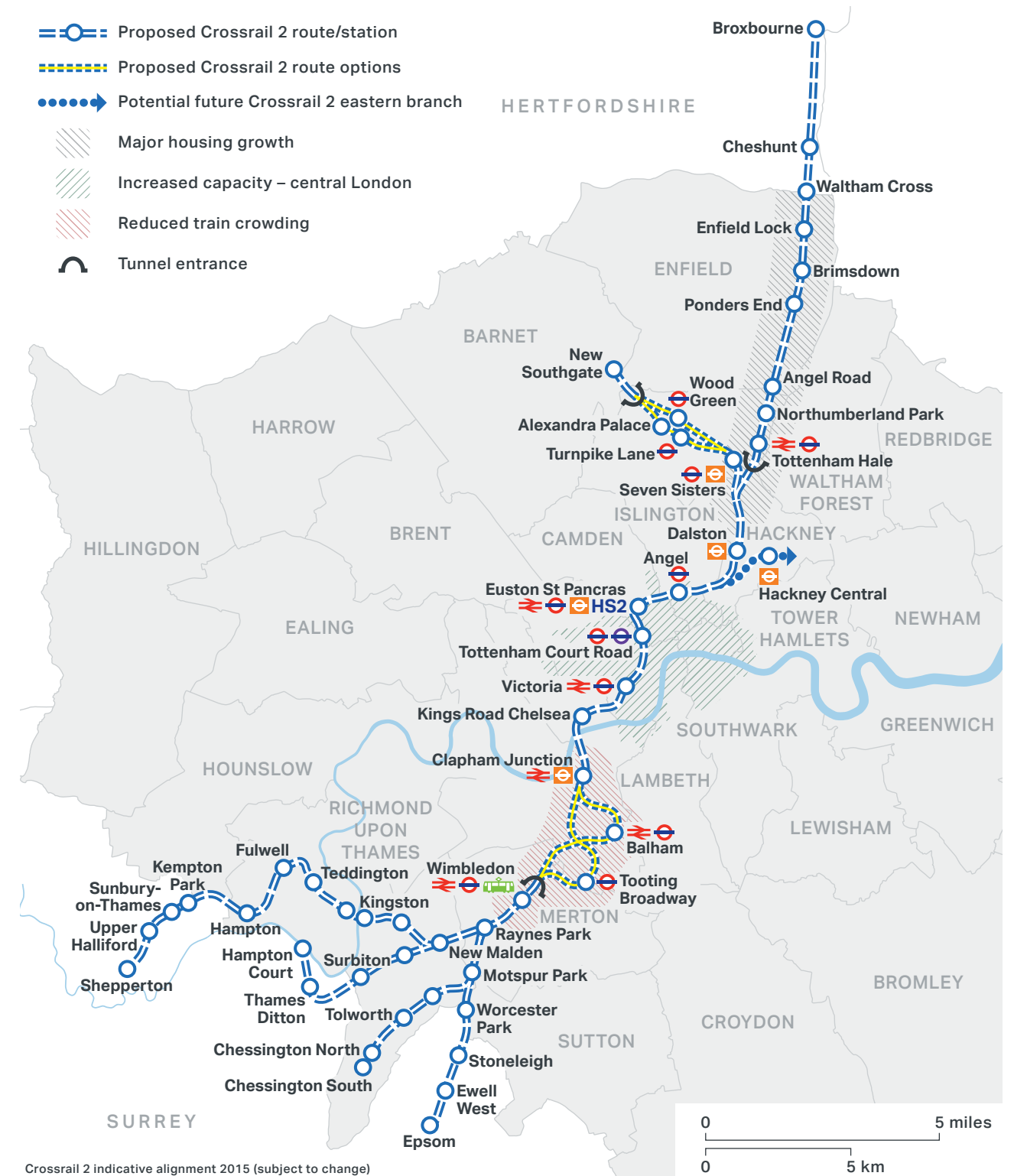
FIGURE 3: CROSSRAIL 2 ROUTE (CONSULTATION 2015)

People need to make local trips, however many have no choice but to use cars because there are no suitable public transport alternatives. New and better services are required, particularly in outer London where car use is high and public transport links are relatively poor. Providing reliable bus services and improving rail services are essential to avoid reliance on cars.